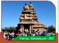
Field Trip Mahabalipuram - 2020