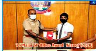
Tamil Nadu SP Office Award Winner (2020)