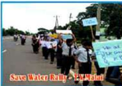
Save Water Rally - P.W.Nagar