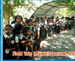
Field Trip (Mamallapuram) 2020