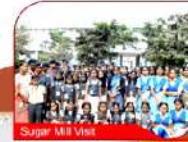
Sugar Mill Visit