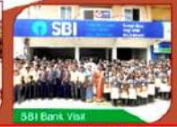
SBI Bank Visit