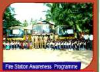
Fire Station Awareness Programme