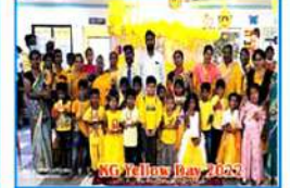
No Yellow Day - 2020