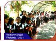
Vedanthangal Fieldtrip - 2021