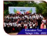
Education Trip Yelagiri Hills - 2022

www.sriramajayamglobalschool.com sriramajayamglobal@gmail.com