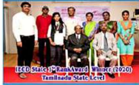
ICD State J Rank Award Winner (2020) Tamil Nadu State Level