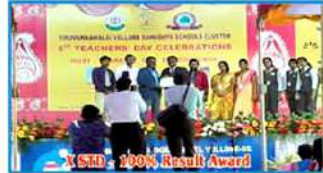
X STD - 200% Result Award