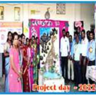
Project day - 2020