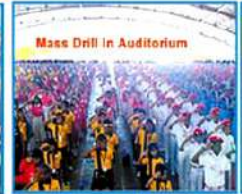
Mass Drill in Auditorium