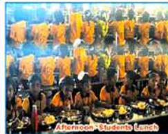
Afternoon - Students Lunch