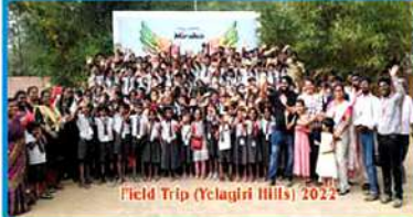
Field Trip (Yelagiri Hills) 2022