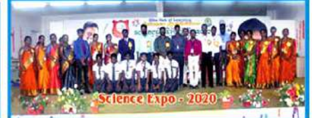
Science Expo - 2020