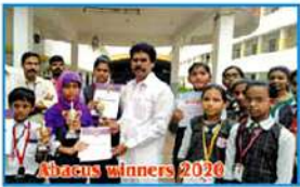
Abacus winners 2020

KIND ATTENTION: PARENTS & STUDENTS Pre-Foundation Competitive Entrance Examination Training Specially for NEET & JEE from GRADE 6 th Onwards