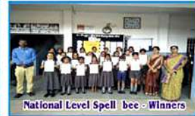
National Level Spell Bee - Winners